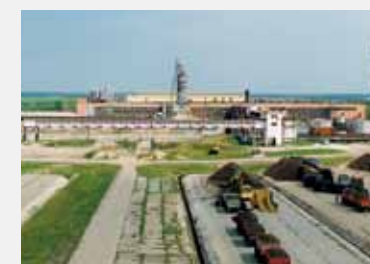
2014-2015: Znamenka, Russia Planning, supply and commissioning of a VKT and automation system; overall planning and project coordination.