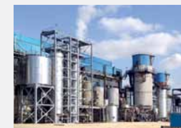
2013: Nile Sugar, Egypt Planning, supply and commissioning of core processes for a beet sugar factory.